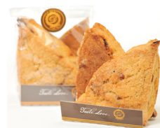
Best if Warmed

Tart cherry & walnut, butter scone Bag warm w/ butter & jam