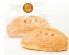
Best if Warmed

Puff pastry filled with guava & cream cheese Bag