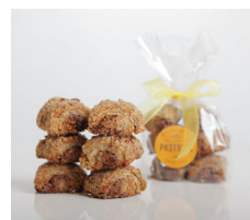
Best if Warmed

Butter puff pastry, pecan sugar and raspberry jam Bag