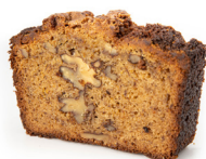
Best if Toasted

Ripe bananas & walnuts Slice - 1/2 loaf - Full loaf