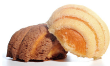
Best if Warmed

Mexican pastry with butter sugar topping, Aztec chocolate and Mexican vanilla Bag