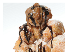
Best with dipping sauces

Homemade fluffy pastry dough, fried and rolled in sugar